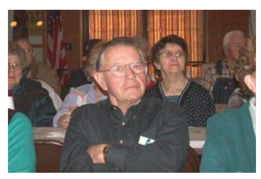
Former board president and other members listen intently to the speakers and their messages to the cooperative members.