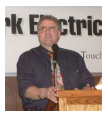
State Senator Dave Zien addresses the membership on political issues that are important to all citizens.