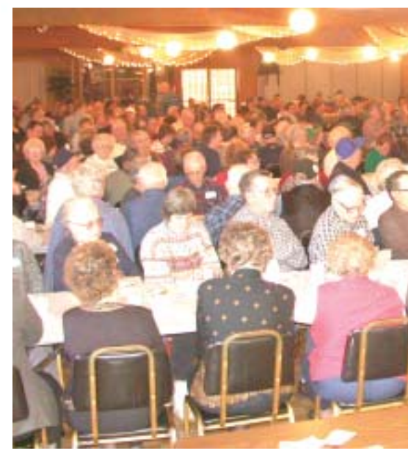
Members of Clark Electric Cooperative listen as many sp